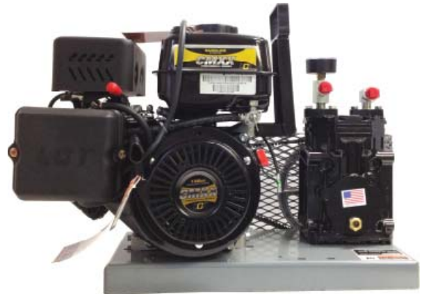
H50LP (LP POWERED)