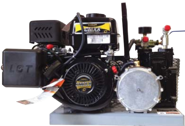
H50GH (GAS POWERED)