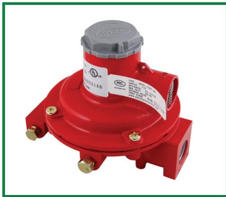
MEGR-1122H Compact Series