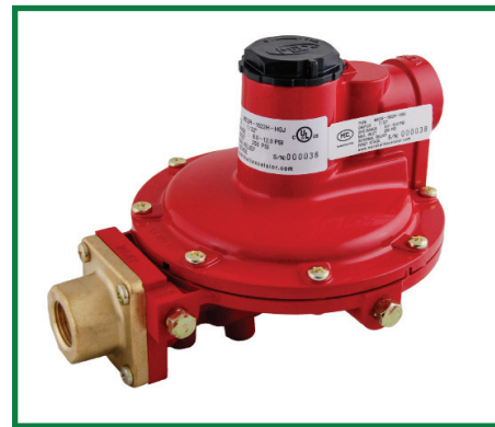
MEGR-1622H Full Size Series