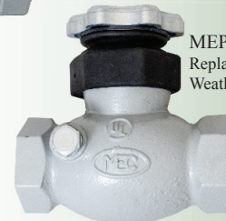
MEP449S-101 Replacement Protective Weather Boot