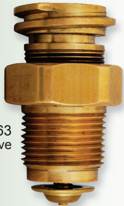
ME663 Double Check Valve