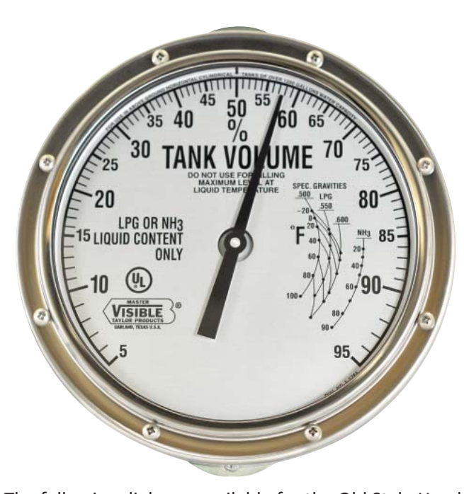
The following dials are available for the Old Style Head. 4102T, 4607T, and Combo"T" 130036, 130030, and 130035