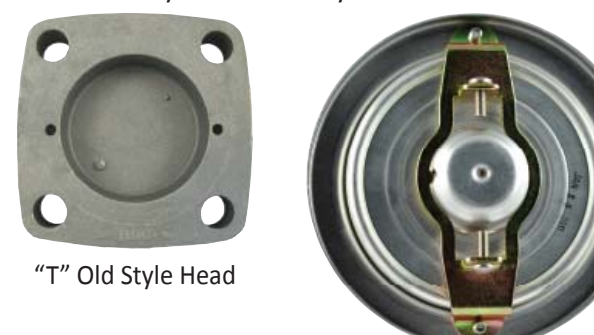
The following dials are available for the Old Style Head. 5520T, 5511T, and 5553T

The Visible "4" dials come in two styles. If you have the Old Style Head then you need a dial with the "T" suffix. If you have the New Style Head then you need a dial with the "R" suffix.