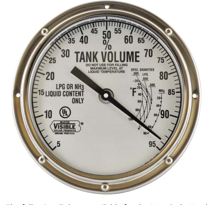
The following dials are available for the New Style Head. 4102R, 4607R, and Combo"R" 130091, 130092, and 130090