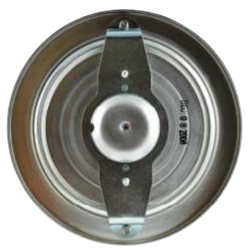
The following dials are available for the New Style Head. 5520R, 5511R, 5553R, and 2778R