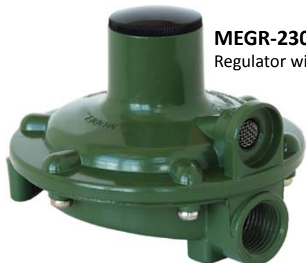
MEGR-230 Regulator with Drip Lip Vent