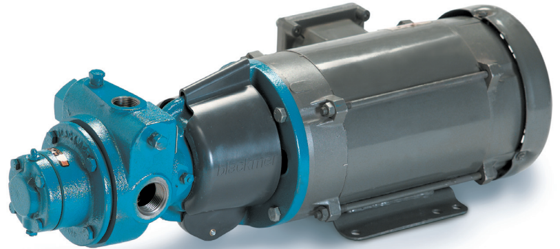
LGF1E and LGF1PE model

How Blackmer's sliding vane action works