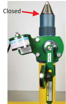
Power Off & Valve Closed.