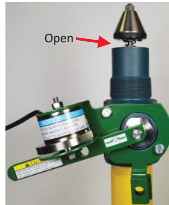
Power On & Valve Open.