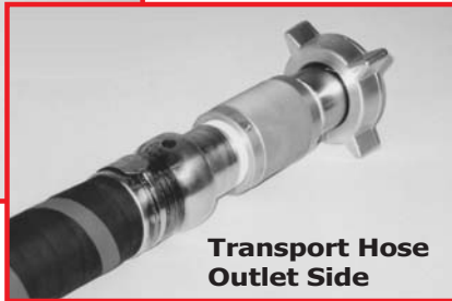
Transport Hose Outlet Side